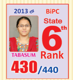
Tabasum State 6th Rank